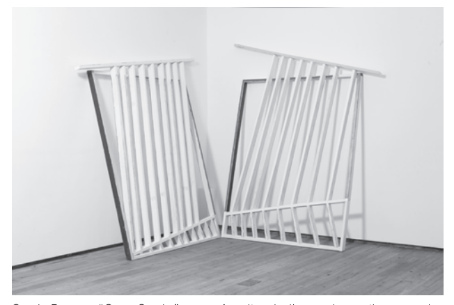
Cordy Ryman, "Case Study," 2013. Acrylic, shellac and pencil on wood, 116 \times 178 \times 26.5 ".

Study" (2013) lying in wait at the bottom of a flight of stairs. Operating as a corner piece, the propped arrangement of beams subtly articulate the space they frame, but the key to the work's success lies equally in Ryman's decision to paint select parts of the white beams in brash, fluorescent colors. This complex interplay of color, both actual and reflected, results in a push and pull that is not simply a coloristic effect given to vision alone, but one that is felt even more emphatically at a physical level, inciting the viewer to move. In this way, Ryman has discovered means to rouse his viewer beyond established pictorial and phenomenological tactics.