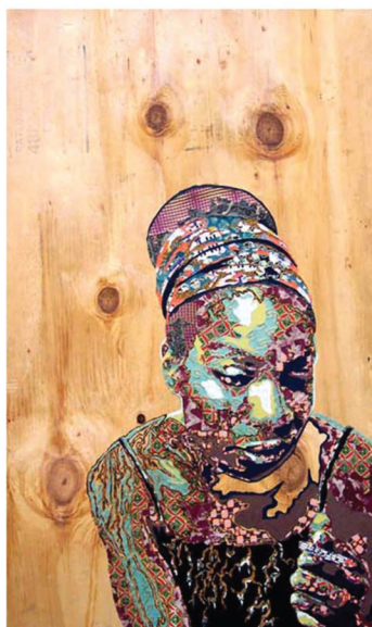
WILLOW WEEP FOR ME; FOR WILD IS THE WIND mixed media on wood panel 28" x 17"