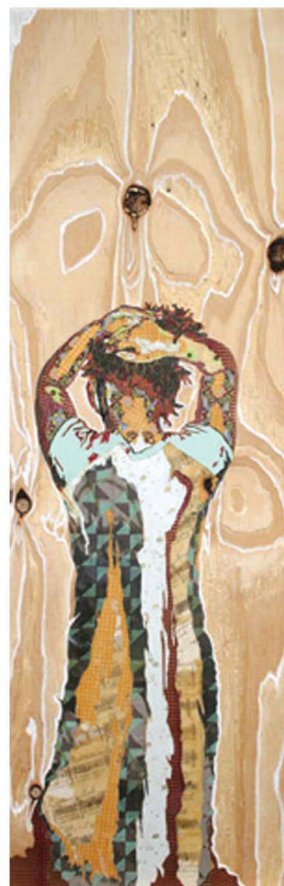
THIS IS HOW I LOVE YOU mixed media on wood panel 34" x 11"