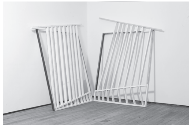
Cordy Ryman, "Case Study," 2013. Acrylic, shellac and pencil on wood, 116 x 178 x 26.5".

Study" (2013) lying in wait at the bottom of a flight of stairs. Operating as a corner piece, the propped arrangement of beams subtly articulate the space they frame, but the key to the work's success lies equally in Ryman's decision to paint select parts of the white beams in brash, fluorescent colors. This complex interplay of color, both actual and reflected, results in a push and pull that is not simply a coloristic effect given to vision alone, but one that is felt even more emphatically at a physical level, inciting the viewer to move. In this way, Ryman has discovered means to rouse his viewer beyond established pictorial and phenomenological tactics.