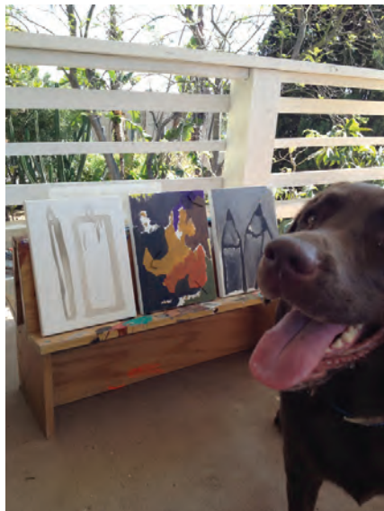
Small paintings, Los Angeles, CA, 2013.